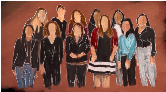
Want to be more involved with STAND? You can learn how to lobby locally, write op-eds and engage within advocacy through the State Advocacy Lead Program. The time commitment is about 3-6 hours each week. Here is the application and position description. Please direct any questions to mrodgers@standnow.org . Applications will be accepted on a rolling basis.

Calling all interested members, join the State Advocacy Lead Program